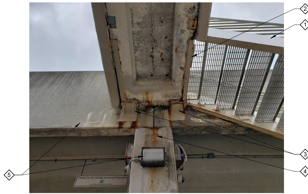
3 BRIDGE CONNECTION - EXISTING CONDITION SCALE: 1/2" = 1'-0"